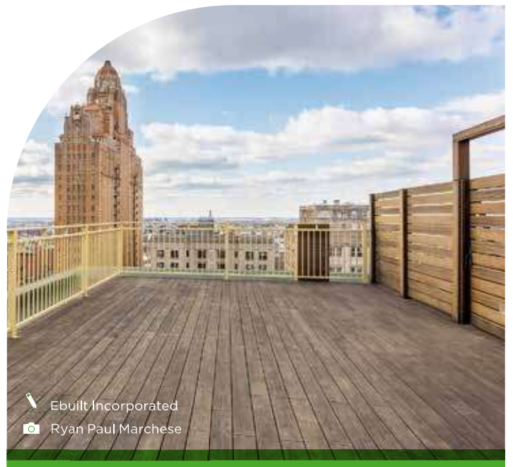
The Versailles Apartment Complex (4,500 sqft) Philadelphia, United States of America