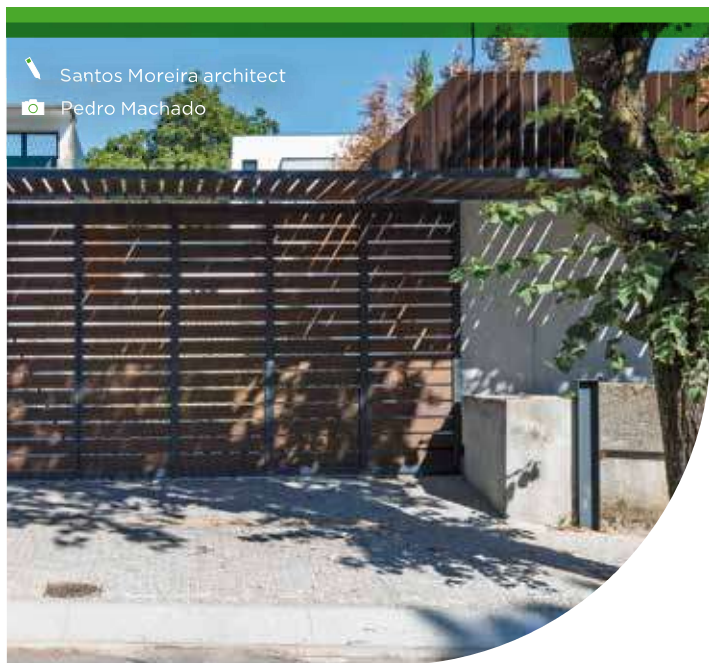
MOSO Office (377 sqft) Barcelona, Spain