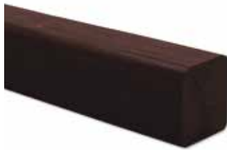
BO-DTHT2173-2 2 x 2 1 1/2 x 1 1/2 x 79"